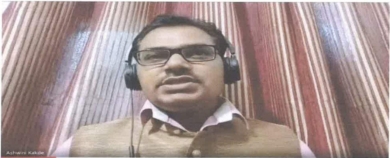
“significant role of Life Science in pandemics like Covid-19”